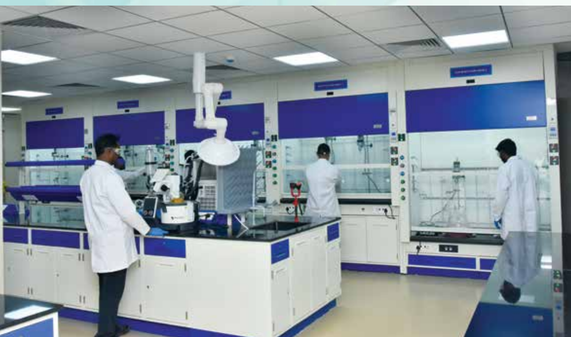
State-of-the-art R&D facilities at Berigai.