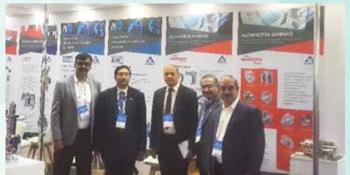
Senior Management team from Engineers India Limited, New Delhi at the stall.