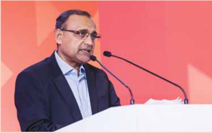
Dr TS Tirumurti

The way we have started projecting India in the last several years has been a very robust type of projection of not just the image of India as a country, but also as a civilisation, and that is the image that we are coming to terms with and that's also, something that the world is coming to terms with.