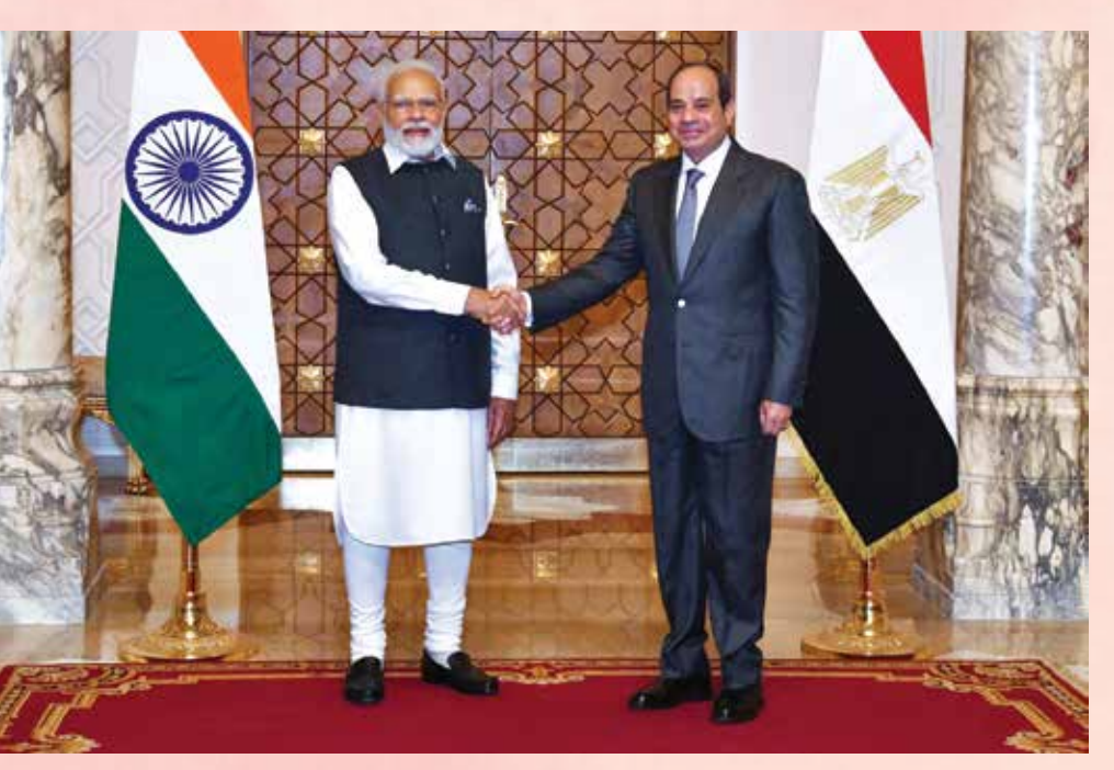
Two world leaders, Prime Minister of India and President of Egypt in Cairo on June 25, 2023.

Prime Minister of India, Narendra Modi was on a two-day visit to Cairo on June 24 – 25, 2023. During the visit, Egypt's President Abdel Fattah el-Sisi discussed ways to further deepen the partnership between the two nations, including intrade, investment, defence, security, renewable energy, cultural, and people-to-people ties.