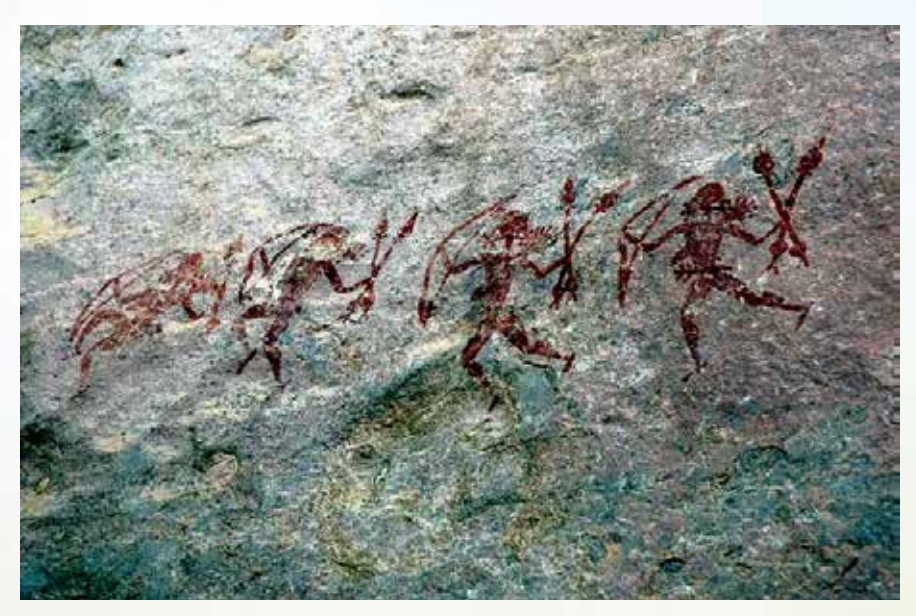
Adamgarh Hills Cave Paintings, Hoshangabad.