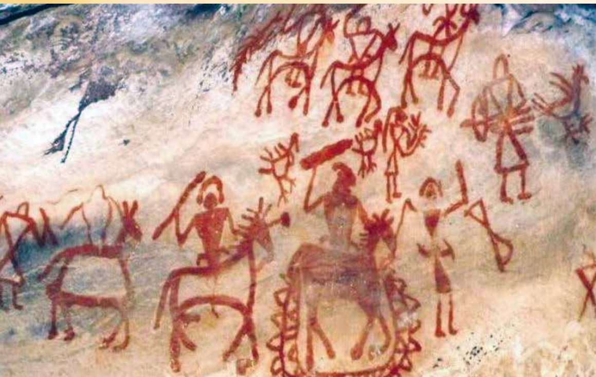
Bhimbetka Cave Paintings, Bhopal

Scholars believe that the Bhimbetka cave paintings were quite mature and advanced for their time and were probably not the first works of art created by human beings in the region.