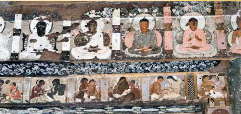
Ellora Cave Paintings, Aurangabad.

The mysterious land of India is filled with unique artefacts and history, and the more you explore the subcontinent, the more amazed you will be by the grandeur of the culture and history. The irony is that these precious paintings have survived nature’s harshness but not human damage.