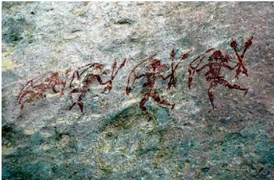
Adamgarh Hills Cave Paintings, Hoshangabad.