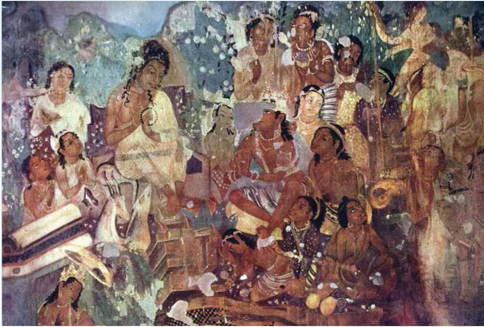
Ajanta Cave Paintings, Aurangabad.

of Shiva and Parvathi as well as some other mythological characters. The paintings were highly decorated as the remains clearly suggest the grandeur and splendour of the ancient ages of India. Cave 4 is based on Jain ideology and has a huge image of Lord Mahavira.