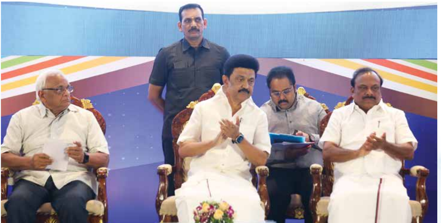
Seated (L to R): N Kumar, MK Stalin, Chief Minister of Tamil Nadu, and CV Ganesan, Minister for Labour Welfare and Skill Development, Government of Tamil Nadu.

According to N Kumar, “Automation is also a reality, so new jobs need to be found as employment in the original term will reduce. Therefore, EFSI needs to work with the Government on one side and with the Industry, Educational institutions such as Engineering Colleges, ITIs and Polytechnics on the other side to bridge this gap and meet the dynamic change.”