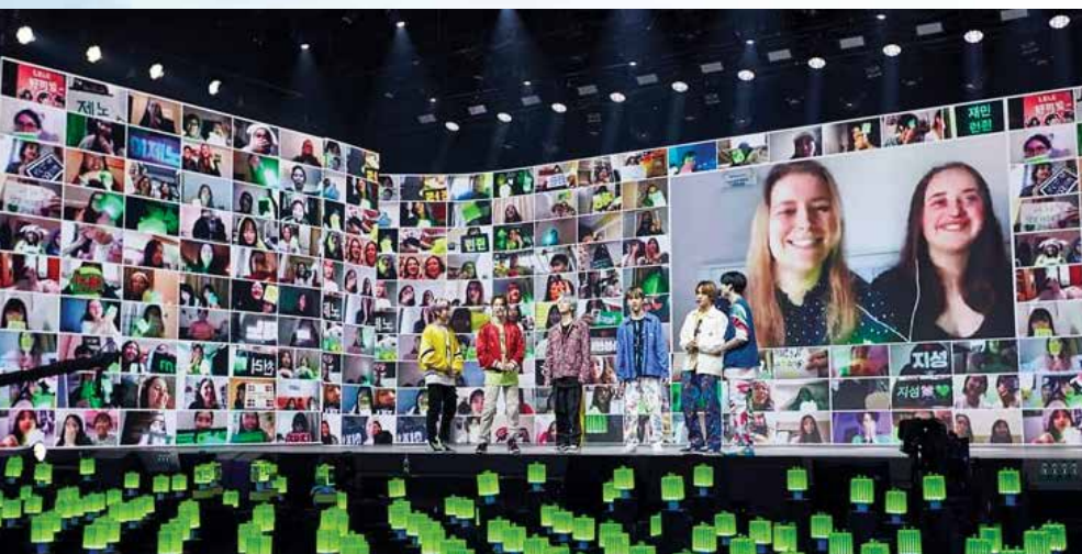
Virtual music festival

Though 2020 was a year of virtual music concerts, in 2021, people started braving COVID and attending festivals. This year the music lovers and organisers are back with a bang, and the season is in full swing like always. It is also likely that the hybrid music festival will be here to stay.