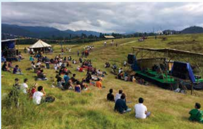
Ziro Music Festival

The Hornbill music festival is held at the Naga Heritage Village of Kisama, Kohima in Nagaland every year to