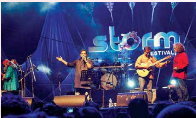
Storm Music Festival

Amidst the lush hills of Rishikesh, Woods Talk is a chill open-air music festival with the passing Ganges adding an adventurous touch. The