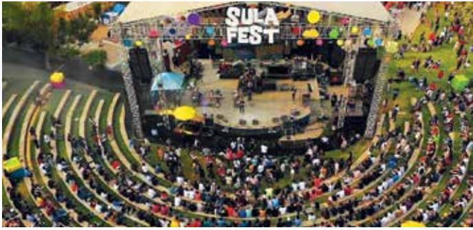
Sula Fest, Nasik

promote inter-tribal interaction and to celebrate the culture and tradition of Nagaland. The week-long festival brings together various tribes in Nagaland. To someone from outside, this festival is to know more about the food, music, dance forms and customs of Nagaland.