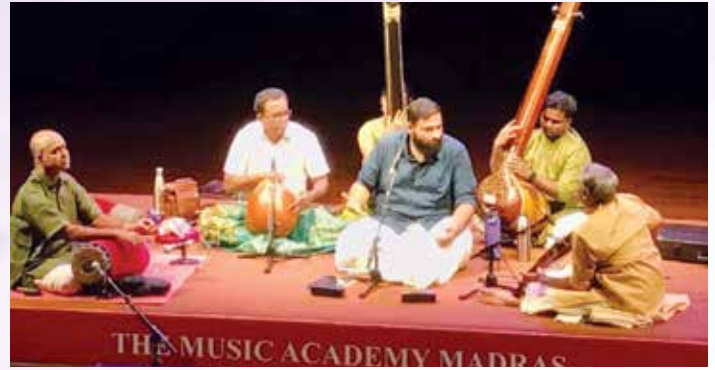
Madras Music Season

festival, usually held in March every year, attracts a large number of people with its cool lineup of musicians. Other than music, numerous adventure activities like kayaking, rafting, rappelling, and rock climbing around the scenic landscapes of the Himalayas are also available.