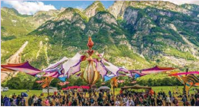
Shiva Squad Festival, Manali