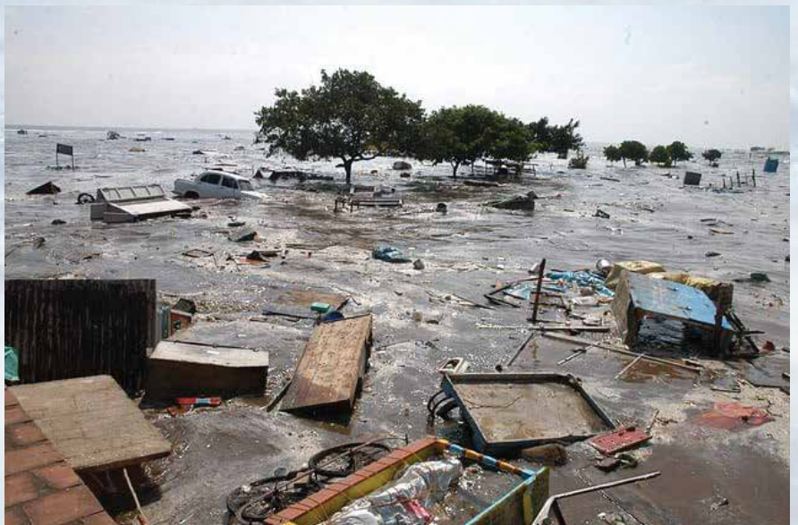
17 years have gone by but the scars of the devastating Tsunami, in Chennai remain.