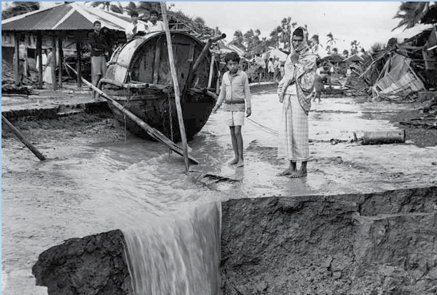
Bhola Cyclone - one of the world's deadliest natural disasters.