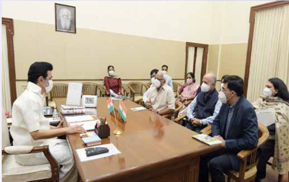
Members of WWF-India delegation with Chief Minister of Tamil Nadu MK Stalin.

They presented the work being done by WWF in the state. The organisation is refocusing on existing projects