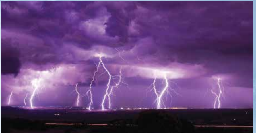
Seven people, including six tourists, have been killed in a violent storm that swept across a region of northern Greece on 10th July 2021.

Perhaps the best defence against a cyclone is an accurate forecast that gives people enough time to get out of the way.