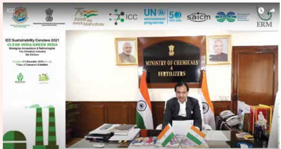
Bhagwanth Khuba, Hon'ble Minister of State for Chemicals and Fertilisers, and New and Renewable Energy, Govt. of India, delivering his address.