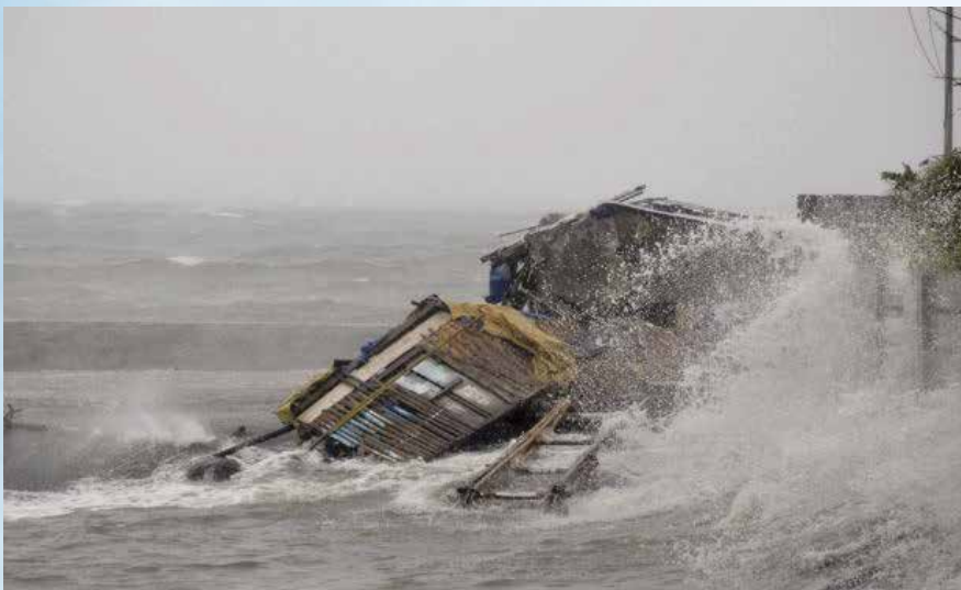
A house is engulfed by Typhoon Haiyan, one of the most powerful typhoons ever recorded slammed into Legazpi city, Albay province in November 2013 south of Manila, Philippines.