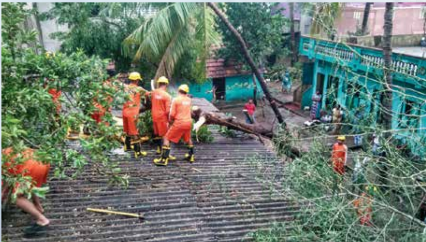
NDRF teams clear up damage after Cyclone Vardah, Tamil Nadu

Here is a peek at some of the worst cyclones that hit the world: