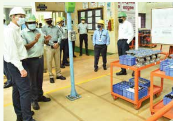
Visitors at the Xomox Sanmar shopfloor at Viralimalai.

The team from Crane visited Sanmar Group's inhouse training institute - "S R Seshadri Training Institute (SRSTI)". A detailed insight on the various types of training provided to fresh Graduate Engineering Trainees as well as continued training to all employees was presented.