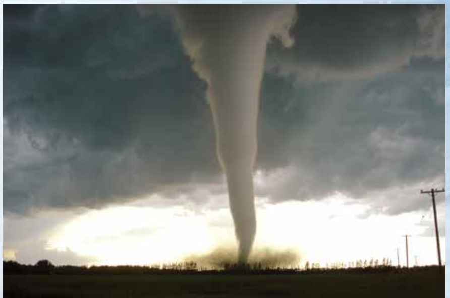
F5 tornado viewed from the southeast as it approached Elie, Manitoba in 2007.