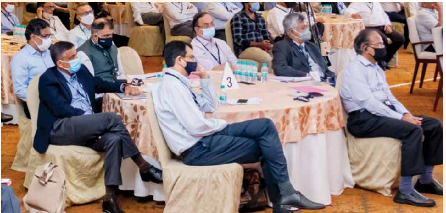
Sanmar Senior Management Team.