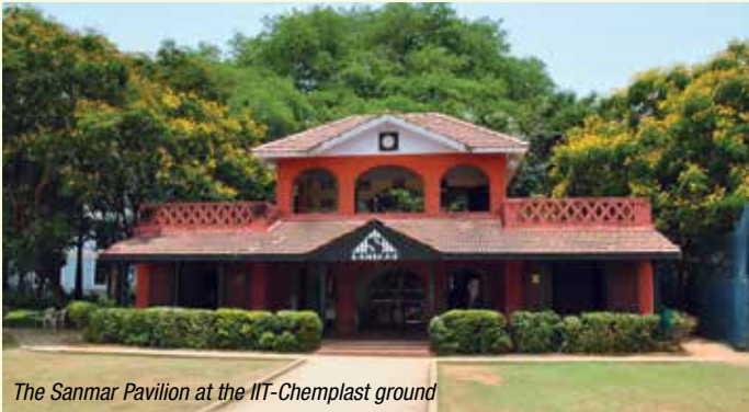
The Sanmar Pavilion at the IIT-Chemplast ground